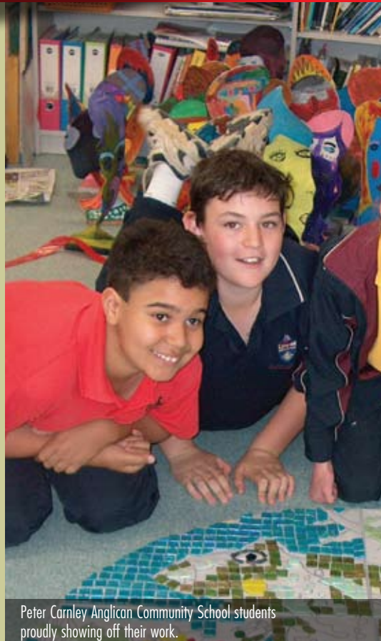
Peter Carnley Anglican Community School students proudly showing off their work.